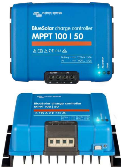
BlueSolar Charge Controller MPPT 100/50